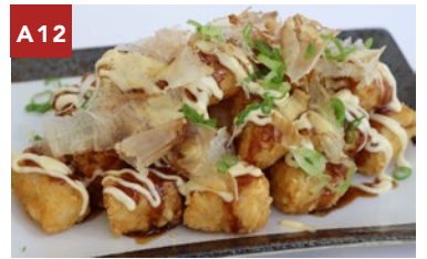
A12 TATER TOTS - $5.5 TATER TOTS DRESSED WITH MAYONNAISE, TONKATSU SAUCE, SCALLIONS AND BONITO FLAKES