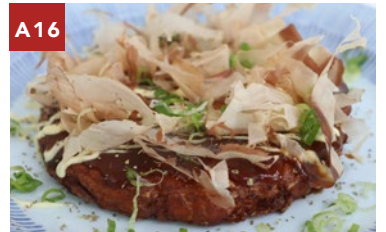
A16 OKONOMIYAKI - 8.5 JAPANESE SAVORY PANCAKE