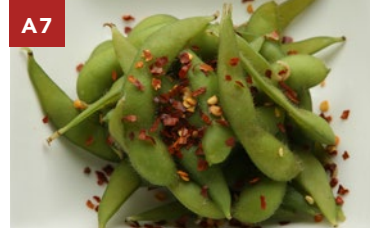
A7 EDAMAME - $5 STEAMED EDAMAME, YUZU VINAIGRETTE, TOPPED WITH SPICY SESAME SEEDS