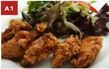
A1 KARAAGE - $7.5 JAPANESE FRIED CHICKEN