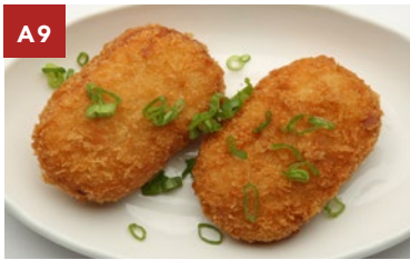
A9 CREAM CROQUETTE - 6.5 POTATO, CREAM AND CORN CROQUETTES (2 PIECES)