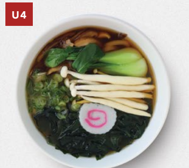
U4 SEAWEED $10.5