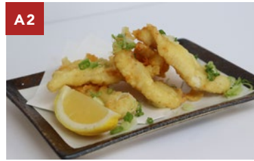
A2 CHICKEN TEMPURA - $8.5 CHICKEN BREAST TEMPURA