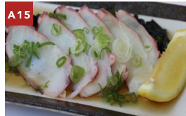
A15 TAKO SU - $8.5 FRESH OCTOPUS SERVED WITH SOY VINAIGRETTE