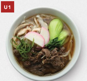
U1 BEEF $14

FISH BROTH BASE, FISH CAKE, MUSHROOMS, BOK CHOY, SCALLIONS