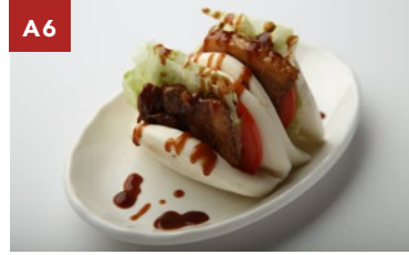
A6 BAO BUN (PORK - $7.5 / BEEF - $8.5) PORK BELLY OR BEEF, TOMATOES, LETTUCE AND CUCUMBERS (2 PIECES)