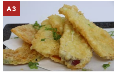
A3 VEGETABLE TEMPURA - $5.5 VEGETABLE TEMPURA SERVED WITH TEMPURA SAUCE