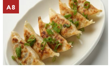
A8 GYOZA - $7.5 PORK AND LEEK DUMPLINGS (5 PIECES)