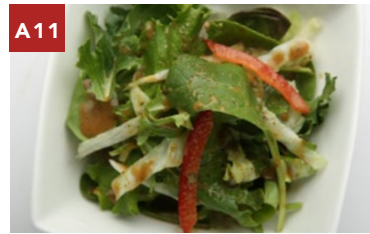
A11 SALAD - $3 SERVED WITH HOUSE MADE DRESSING