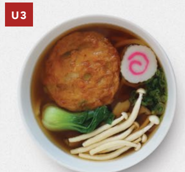
U3 ODEN $13