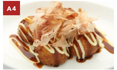
A4 TAKOYAKI - $7.5 BALL SHAPED FRIED APPETIZER WITH OCTOPUS (5 PIECES)