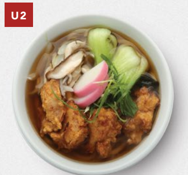
U2 KARAAGE (FRIED CHICKEN) $14