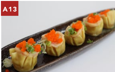
A13 EBI SHUMAI - $8.5 MINCED SHRIMP AND VEGETABLES, SERVED WITH PONZU SAUCE