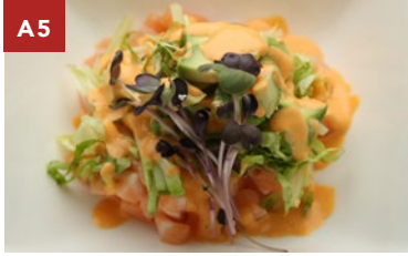
A5 POKE BOWL (OVER RICE) - 10.5 SALMON, CUCUMBERS, AVOCADO, FISH ROE, MIXED GREENS, SPICY MAYO