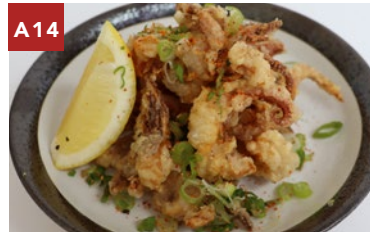
A14 IKA GESO KARAAGE - $8.5 FRIED SQUID LEGS WITH SPICY ASIAN MARINARA