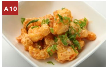
A10 ROCK SHRIMP - $8.5 TEMPURA BATTERED SHRIMP, SPICY MAYO, SCALLIONS AND FISH ROE